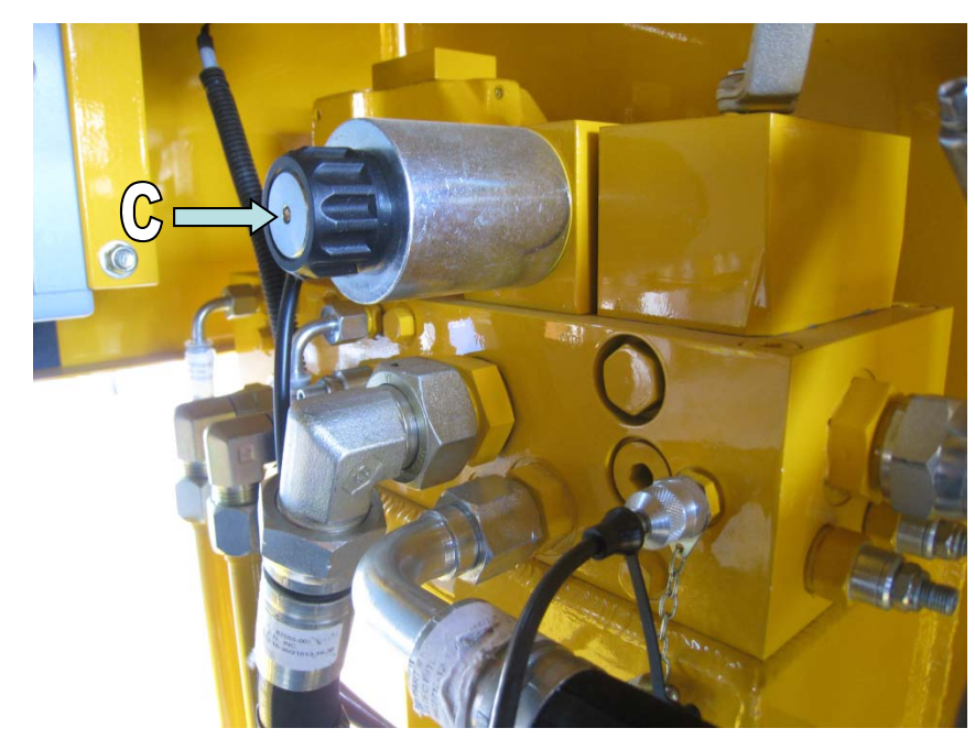
S-TUBE CIRCUIT MANIFOLD