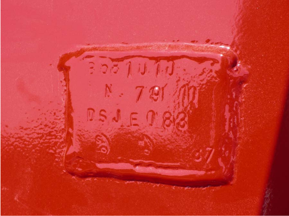
Boom Serial Number